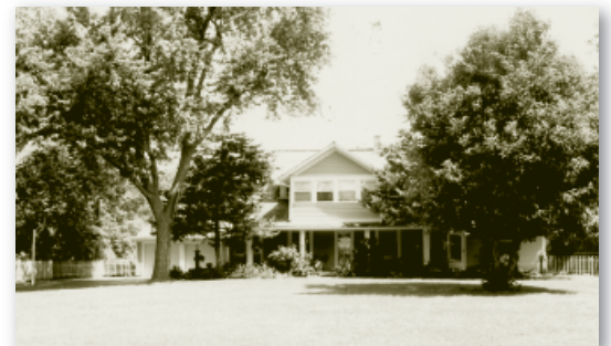
Oscar Lee Home