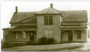
Coulter Home c. 1900

The classic drive-in operated for 25 years at 123rd & State Line Road. Its colonial facade was a landmark in the southern part of the city.